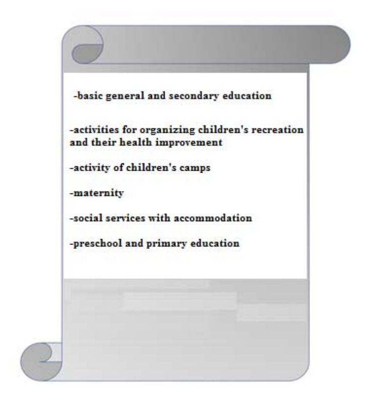
Fig. 4. List of control objects at which supervisory measures were allowed to be carried out in 2022, according to PPRF № 336